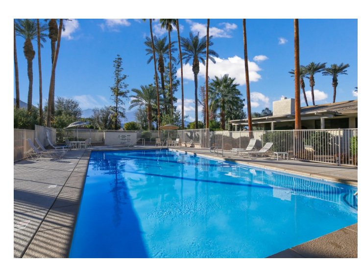
Offered at: $1,295,000.